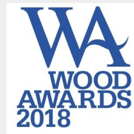
Wood Awards 20 November 2018 London