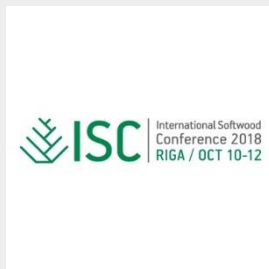
International Softwood Conference 10-12 October 2018 Riga, Latvia