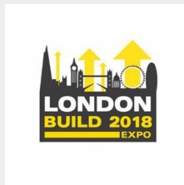
London Build 23-24 October 2018 London