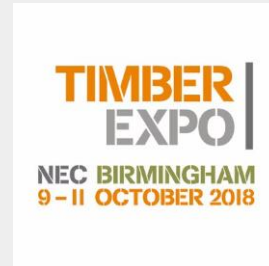
Timber Expo 9-11 October 2018 NEC, Birmingham